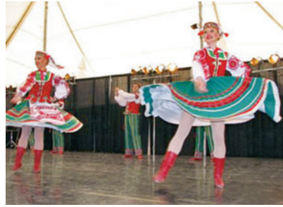
▲ Ukrainian Dance performance at the Cultural Pavilions of GlobalFest