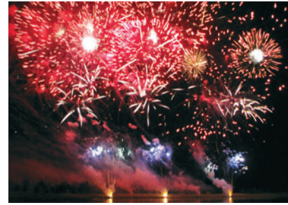
▲ Fireworks display during the Portugal Night of the 2007 GlobalFest International Fireworks Competition